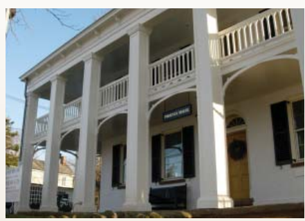
In Mendham, the Phoenix House is restored for continued use as the borough hall.

The New Jersey Historic Trust, a DCA affiliate, provides financial support through Capital Preservation and Historic Site Management Grants. Capital Preservation Grants fund "bricks and mortar" projects, while Historic Site Management Grants provide support to help organizations make better decisions about their historic structures. Since 1990, 454 preservation projects in 109 municipalities have received more than $96 million in grants.